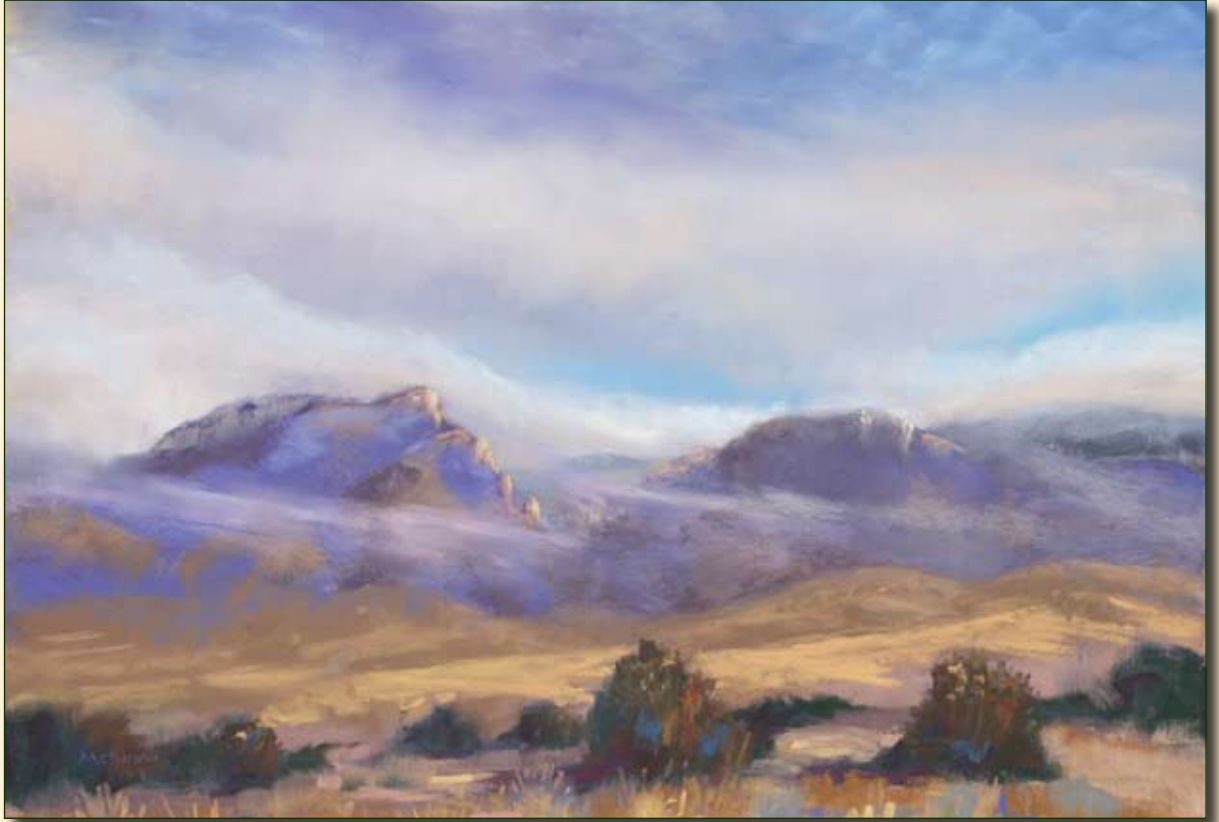
Aldo Leopold Overlook, Gila Wilderness